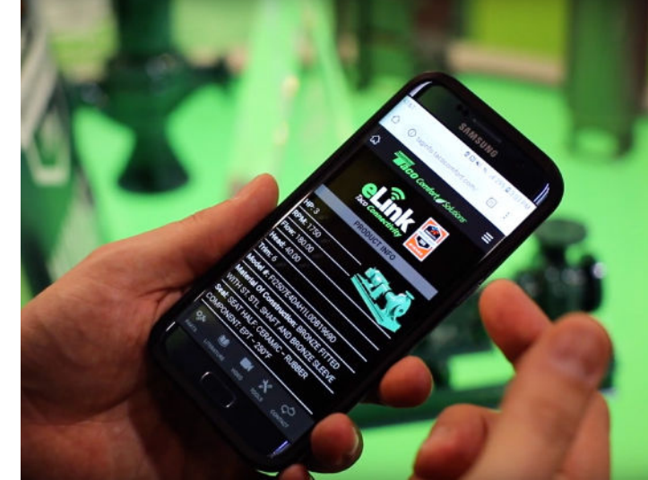
Tradeshow Tradeshow Mobile App